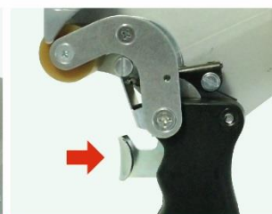
Smart cut off

We give the technical data of our products, however non-committal, after the best knowledge.